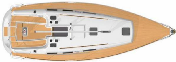
Manufacturer Provided Image: Deck Layout